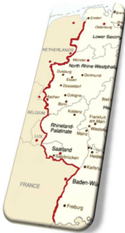
Fig. 1. Study region Boundless Trauma Care Central Europe.

cooperation and regionalisation in their region, as well as their perception of possible benefits and drawbacks of such cooperation.